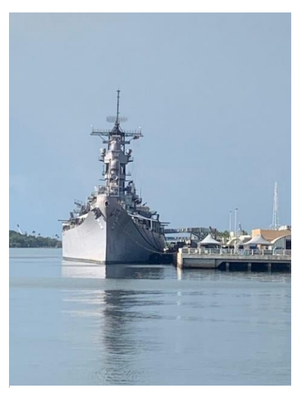
Pearl Harbor tour of Bowfin Submarine, the Arizona, Air Museum, and the Missouri. Very emotional and educational at the same time.