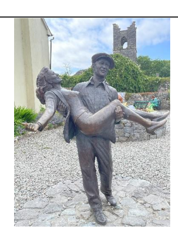
"The Quiet Man" Statue