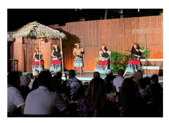
The Royal Luau. Good food, good drinks, good show with new friends.