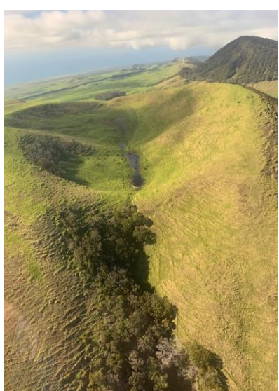
Checking out the volcanos, cliffs, waterfalls, and general landscape from a helicopter. WOW!