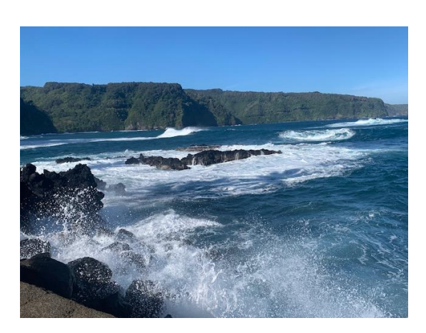
Big surf and lava rocks everywhere.