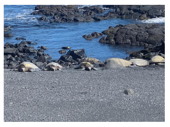
Sun-bathing turtles at Black Sand Beach.