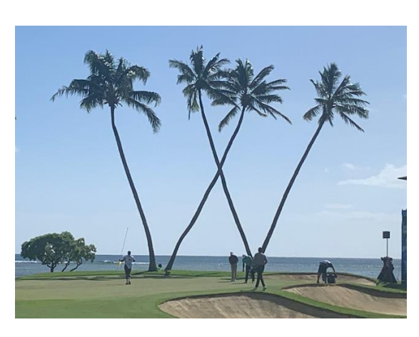
Watching the big boys play golf at Waialea.