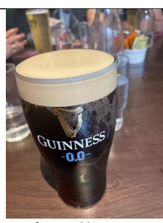
My first and last Guiness