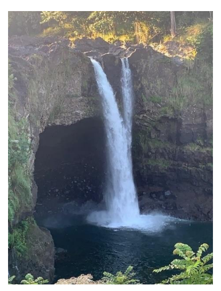
We saw MANY spectacular waterfalls on each island.