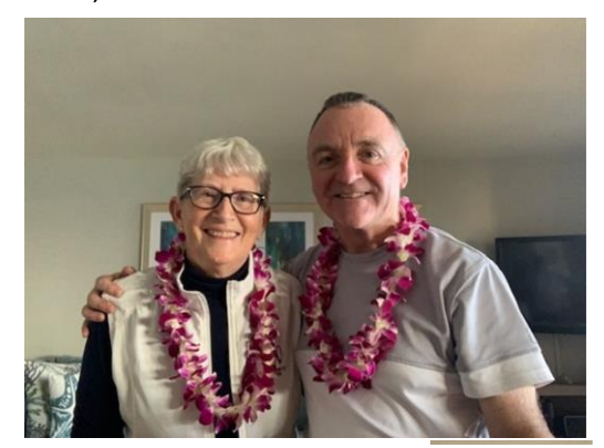
We've arrived. Aloha Maui!