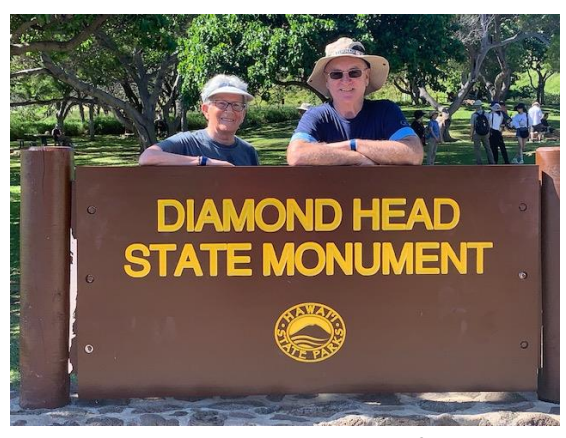
Just prior to our hike to the top of Diamond Head crater.