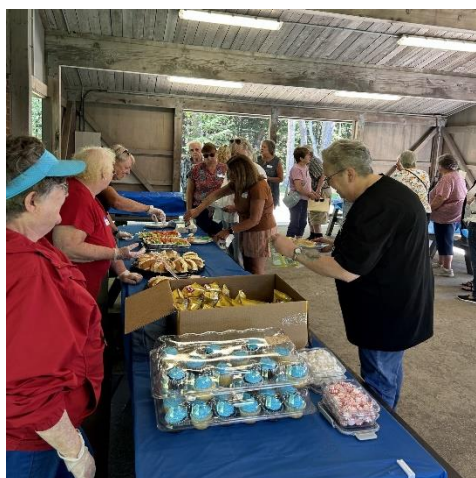
Lunch being served.