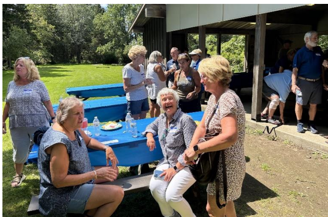
More catching up!