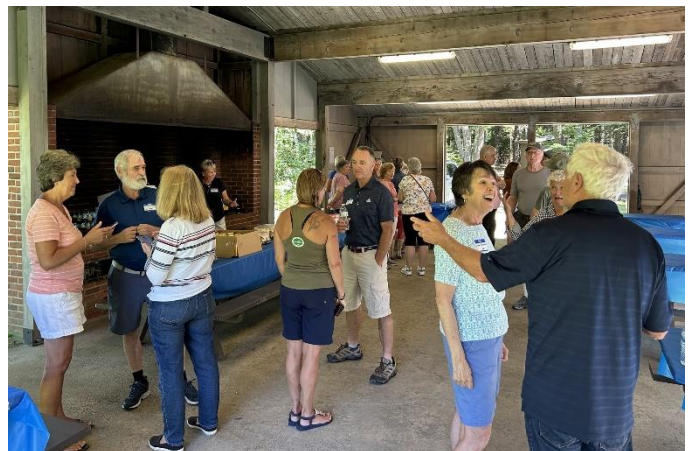
A lot of catching up going on here!